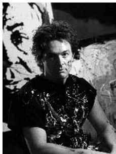
Jean Francois Detaille